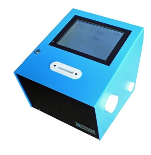
RHOTEC L Laboratory Density Meter

RHOTEC L continuously measures the density of liquids. Designed for laboratory applications that require maximum sensitivity and high accuracy, this device is ideally suited for extremely small sample volumes. For density measurement, the liquid flows through a U-shaped tube. While the tube is electronically excited to oscillate at resonance, the oscillation frequency is observed. Any change in the fluid density has an impact on the detected signal and can thus be identified. As a specific property of each liquid, the correlation between concentration and density can be described by a mathematical polynomial. With decades of experience and own laboratory facilities, we have a particular knowledge of the polynomials for a huge number of products. Any temperature drifts of the measured signal are automatically compensated for by an internal Pt1000 sensor. RHOTEC L is equipped with a very quick and accurate temperature controller based on Peltier technology. The 10" touch screen, the compatibility of the software and various interfaces for data exchange make RHOTEC L extremely user-friendly. The instrument displays various units, e.g. vol.%, mass %, °Brix and °Plato.