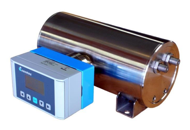
RHOTEC Transmitter Version

RHOTEC continuously measures the density of liquids. Designed for applications that require maximum sensitivity and high accuracy, this device is used in various industries all around the world. Breweries and beverage manufacturers determine alcohol or dissolved sugar contents inline with RHOTEC. Dairies rely on RHOTEC to measure milk and cream fat. In numerous pharmaceutical and chemical applications RHOTEC is used to control the concentration of acids, caustics and other solutions — but also for monitoring the quality of raw materials and final products. For density measurement, the liquid flows through a U-shaped tube. While the tube is electronically excited to oscillate at resonance, the oscillation frequency is observed. Any change in the fluid density has an impact on the detected signal and can thus be identified. As a specific property of each liquid, the correlation between concentration and density can be described by a mathematical polynomial. With decades of experience and own laboratory facilities, we have a particular knowledge of the polynomials for a huge number of products. Any temperature drifts of the measured signal are automatically compensated for by an internal Pt1000 sensor. RHOTEC displays various units, e.g. vol.%, mass %, "Brix and "Plato.