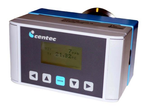
OXYTRANS TR Transmitter Version

OXYTRANS continuously measures the content of oxygen in liquids and gases. Designed for applications that require maximum sensitivity and high accuracy, this device is used in various industries all around the world. Breweries and soft drink manufacturers determine the O_2 content in deaerated water and beverages with OXYTRANS. Oxygen measurement during fermentation is an ideal application. Numerous power plants use the sensor to monitor oxygen levels in their boiler water. The state of the art optical measurement technology is based on the effect of luminescence quenching, i.e. the radiationless redistribution of excitation energy via a molecular interaction. An indicator layer on a small glass component ("optical window") installed in the measuring head is illuminated with blue-green-light. When the indicator molecules absorb the incident light they are promoted to a higher energy state. After a certain time they convert back to their ground state during which a detectable red light is emitted. If O_2 is present the energy is transferred from the indicator molecules to the oxygen. The detected signal decreases according to the oxygen content. OXYTRANS displays various units, e.g. ppb, ppm and % oxygen. The lightweight portable device is very robust and can easily be connected with hoses.