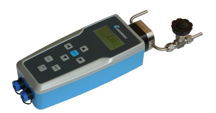
OXYTRANS M Portable Version